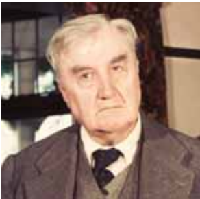
The nine symphonies of Ralph Vaughan Williams page 11