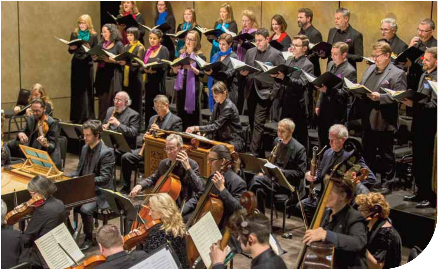
Philharmonia Baroque Orchestra & Chorus, 2020