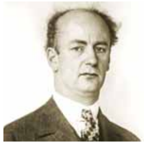
Wilhelm Furtwängler and the nine symphonies of Beethoven page 18