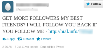
Figure 2: A tweet advertising a Twitter Account Market

cal does not work. The reason is that Twitter is known for having techniques in place to detect misuse. Consequently, to avoid being detected or blacklisted, miscreants slightly modify the content of the tweets or use different URLs (e.g., by leveraging URL shortening services). These minor modifications of their messages are commonly enough to avoid detection. Unfortunately, relying solely on hashtags to determine similarity is not sufficient either. The reason is that not all campaigns we observed made use of hashtags consistently.