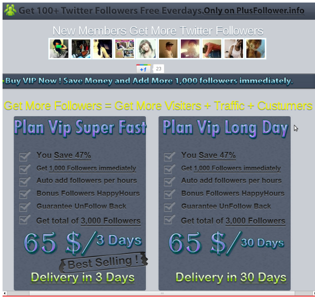
Figure 1: A Twitter Account Market