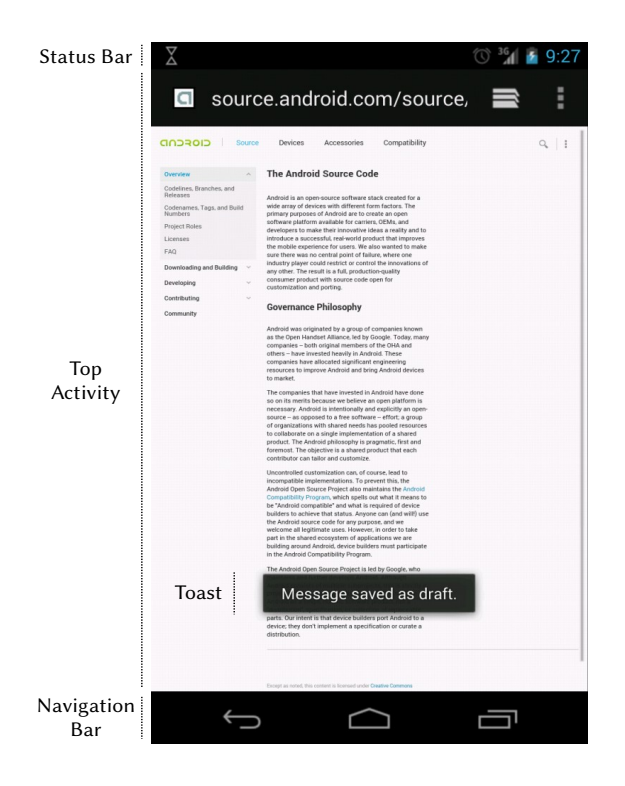
Fig. 2: Typical Android user interface appearance. The status bar is at the top of the screen, while the navigation bar occupies the bottom. A browser app is open, and its main Activity is shown in the remaining space.

To perform sensitive operations (e.g., tasks that can cost money or access private user data), apps need specific permissions. All the permissions requested by a non-system app must be approved by the user during the app's installation: a user can either grant all requested permissions or abort the installation. Some operations require permissions that are only granted to system apps (typically pre-installed or manufacturer-signed). Required permissions, together with other properties (such as the package name and the list of the app's components), are defined in a manifest file (AndroidManifest.xml), stored in the app's apk file.