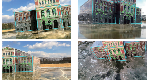
Figure 1: Examples of images from 4 datasets with overlaid edges of the estimated pose.