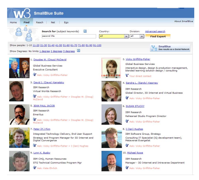
Figure 2. SmallBlue Find. The list shows the top-10 experts in the company. For each person, it shows division, job title and job role. Moreover, it shows the shortest social path from the user to reach that person.

Consider the case of someone who has been asked by her or his manager to gather information about Second Life, the 3D virtual environment. In addition to looking at online sources and perhaps consulting internal blogs or social-tagging systems if they exist within the company, the person might also use want to find who in the company might be an expert in Second Life. Entering "second life" into the search window would bring up the display shown in Figure 2.