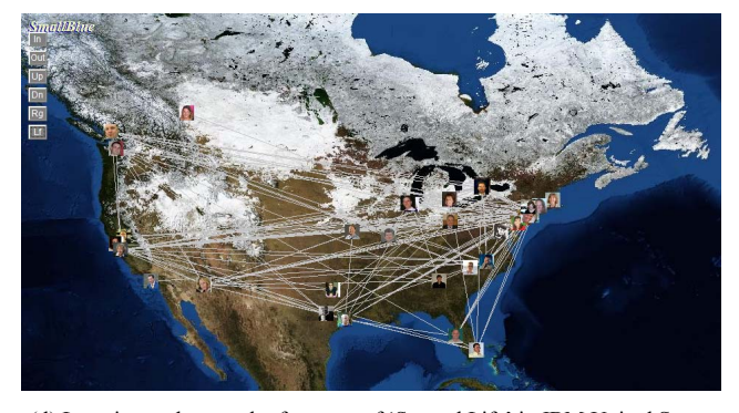
(d) Location and network of experts of 'Second Life' in IBM United States

Figure 4. SmallBlue Net. (a) Clustering of social network of experts on Second Life at IBM. (b) Key bridges in this social network. (c) Key hubs in this social network. (d) Location and social network of Second Life experts at IBM US.