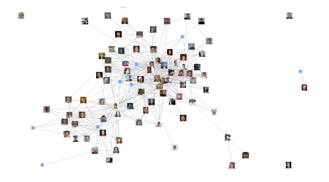
(a) Clustering of social network of experts of 'Second Life' in IBM