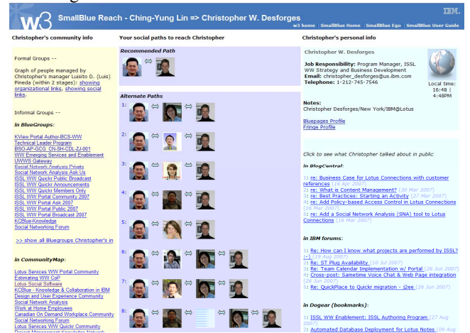
Figure 3. SmallBlue Reach. The left-hand side shows this person's community information. The middle part shows the shortest social paths from the user to reach another person up to six degrees. The right-hand part shows the personal activities, for example, posting on blogs, forums, social bookmarks of Web pages, and so on. We can see the self-described expertise of the target person.

Expertise locator systems should provide users with information to help them reach their own determination of the appropriateness of a candidate's expertise, and their likely responsiveness to being approached. SmallBlue provides this information in two ways. Information about social distance appears in the Reach tool within the system. From the Find page, users can click on a name or picture to navigate to the Reach page (Figure 3), which displays current public information about the selected person, including a list of the shortest paths and up to 16 alternate paths that link the seeker to the expert. In Reach pages, shortest paths are provided up to six degrees.